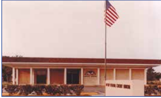
1900 McCoy Road, 1981

1954 On December 14, 1954, seven people pooled their knowledge and assets to establish the Pine Castle Air Force Base Federal Credit Union, a military member credit union.