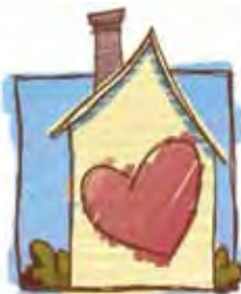
The Russell Home